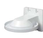
WV-QWL500-W Mount Bracket