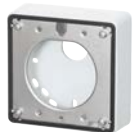
WV-QJB500-W Mount Bracket